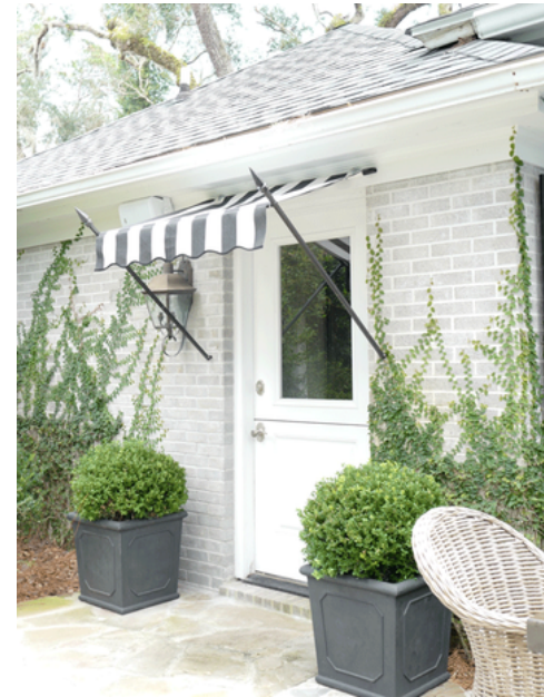
Photo Shown has Custom Arm Lengths

1111 South Talbot St. St. Michaels, MD 21663