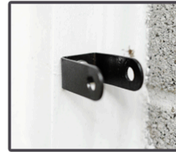
Hinges for Arm & Stanchion