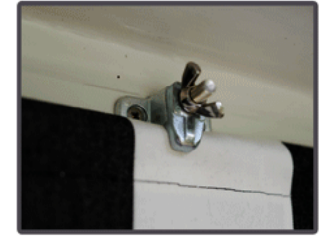
Headrod Clamp- Clamp over fabric and tighten wingnut.