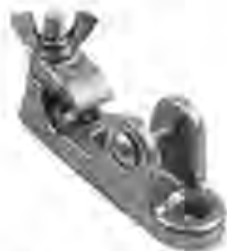
Rod & Rafter Holder